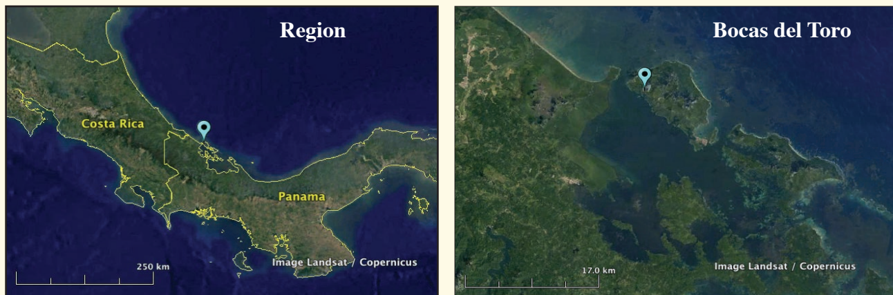
Fig. 1. Location of the Institute for Tropical Ecology and Conservation in Bocas del Toro, Provincia de Bocas del Toro, Panama. All data collection was conducted in lowland rainforest in the vicinity of the station.

I conducted daily observations from 0900 to 1100 h and from 1300 to 1600 h, from 29 July to 8 August 2013, and from 1 July to 12 August 2014, for a total of 42 days of sampling. I chose the above-mentioned observation times to ensure the sampling occurred when the frogs were most active in their territories (Haase and Pröhl, 2002; Pröhl, 2002; Bee, 2003).